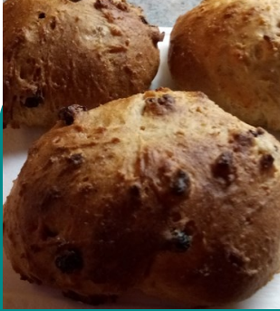
Right: Alison and Kathryn rolling out the dough and baking the hot cross buns for Riverstown house. Lucky Riverstown!

Easter preparations continued as normal during Holy Week.