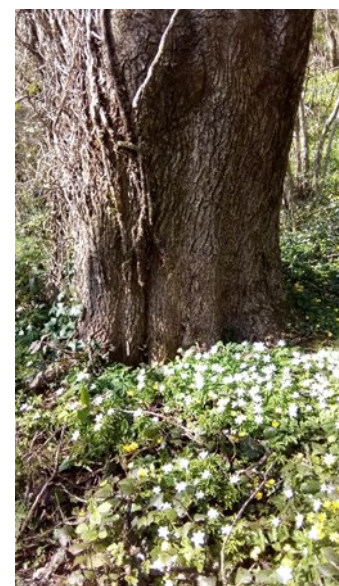
Right: Old and young on the river walk, as the new spring flowers blossom under the protection of the old gnarled tree.