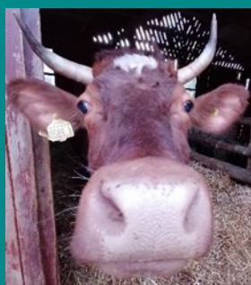
Funny animal picture of the week!