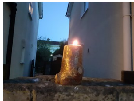
Above: The Candle of Hope is lit during lockdown.